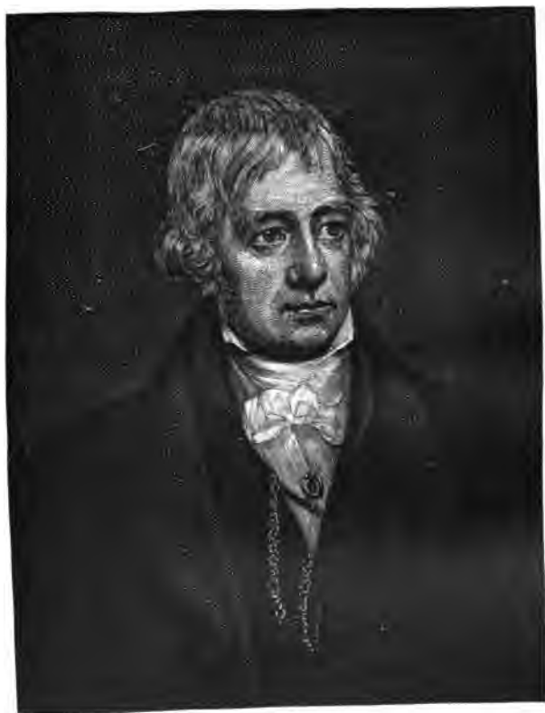
SIR WALTER SCOTT

her se ght, r rst pe posed reposit in th of her d she ! By "this that her ray, eds, 'hus osi- sty ng te re st f